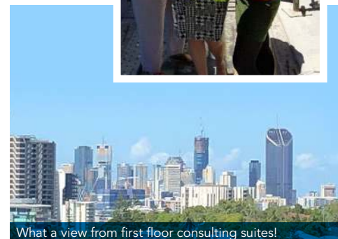
What a view from first floor consulting suites!