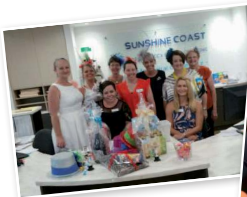
Sunshine Coast Haematology & Oncology ↗

MONTSERRAT STAFF celebrated this years Melbourne Cup in style.