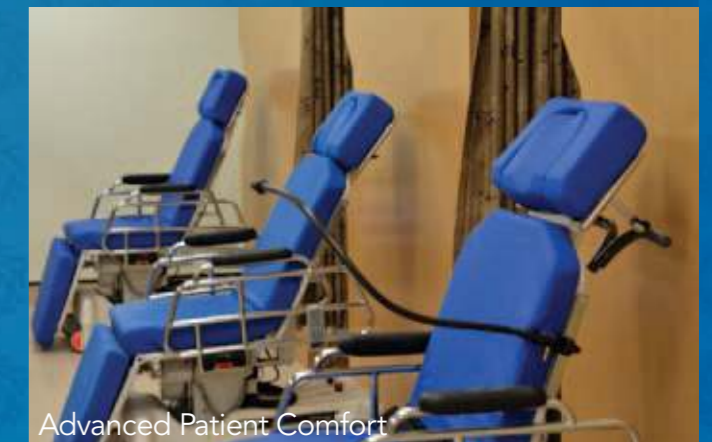
Advanced Patient Comfort