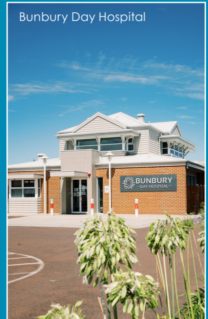
Bunbury Day Hospital