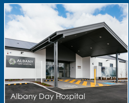
Albany Day Hospital